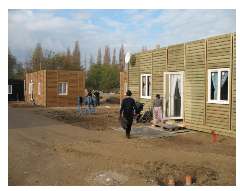
Project in Orly during the construction step