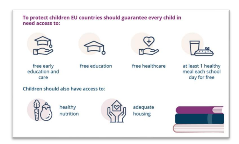
Infographic - European Child Guarantee: how the EU protects children, European Commission

These EU initiatives, together with the <u>EU Roma Strategic Framework for equality, inclusion and participation 2020-2030</u>, including the <u>European Commission Communication</u> and the <u>Council Recommendation</u>, contribute to the joint efforts to make EU rights and values more tangible for Roma adults and children across the EU.